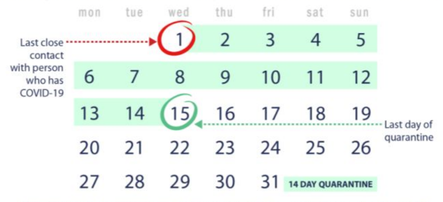
Date of last close contact with person who has COVID-19 + 14 days= end of quarantine

Please note if your quarantine starts at noon on day 1, then it would end at noon on the last day.