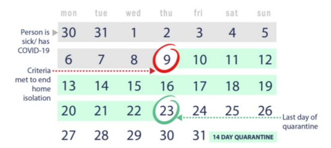
Please note if your quarantine starts at noon on day 1, then it would end at noon on the last day.

I live in a household where I cannot avoid close contact with the person who has COVID-19. I am providing direct care to the person who is sick, don't have a separate bedroom to isolate the person who is sick, or live in close quarters where I am unable to keep a physical distance of 6 feet. You should avoid contact with others outside the home while the person is sick, and quarantine for 14 days after the person who has COVID-19 meets the criteria to end home isolation. Date the person with COVID-19 ends home isolation + 14 days = end of quarantine